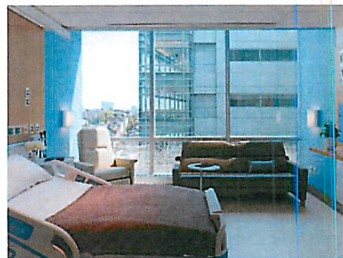
The private rooms within the W. Gerald Austen Inpatient Care Pavilion are incredibly spacious, with comfortable seating areas for visitors and family members. Each also offers beautiful exterior views of Boston.